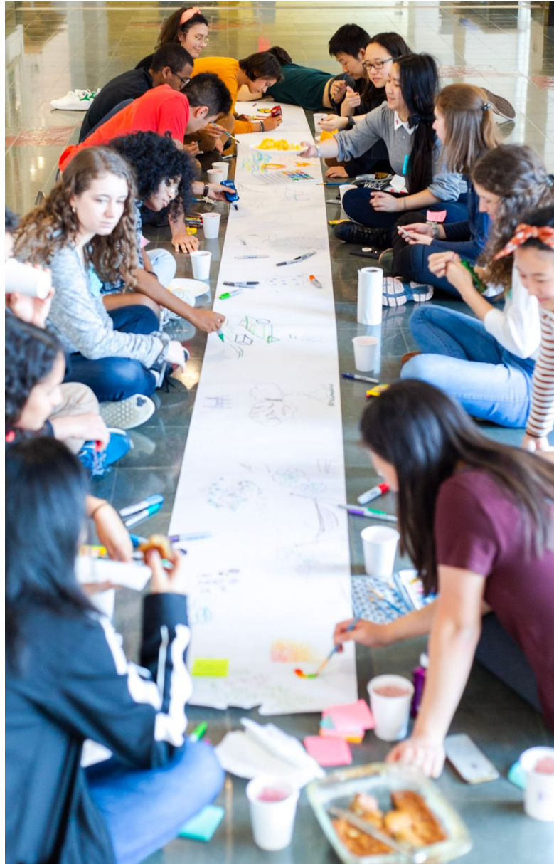
Our onboarding meeting (10/15)

Second, our eight existing projects have been making good progress: Banana Lounge celebrated 100k bananas delivered and a quarter million student visits, back in October (10/25); Arts built and deployed a mobile cart with art supplies for campus; Infinite Space is working with OEL to engage students on issues around the world; Good Grub has been working with “6am health,” the company that makes the new vending machines